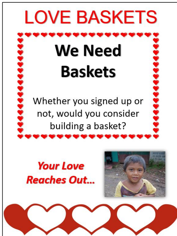
Table top sign examples. Best used with stand-up 8 ½ x 11 sign holders.